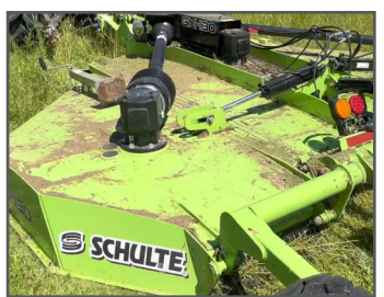
Continuously welded single domed deck

Solid laminated tires 20" or 26" • Forklift tires • 4 or 6 tire options • Safety light kit • Pro Level or solid tongue hitch • Leveling rod • 540 RPM drive package • Single chains (optional double chains)