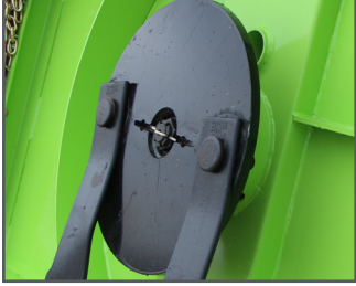
Heavy duty 3/4" thick blade disc with 4" blades and pentagon blade bolts