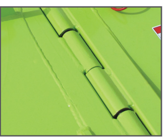
Heavy duty cast hinge line with wiper seals

Solid laminated tires 20" or 26" • Forklift tires • 4 or 6 tire options • Safety light kit • Pro Level or solid tongue hitch • Leveling rod • 540 RPM drive package • Single chains (optional double chains)