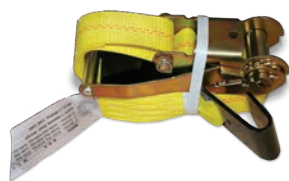
RATCHET STRAP 2" X 20' HWG100220 $22.95 2" X 27' HWG100227 $24.95