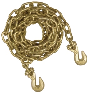
CHAINS FOR ADDED SAFETY SAFETY CHAINS 3/8" & 1/4" TRANSPORT CHAINS 5/16" AND 3/8"