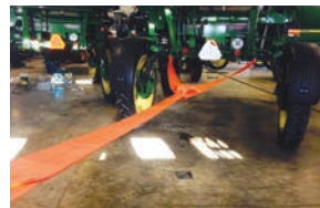
RIG-IT 2" X 27' TOW BRIDAL FOR SPRAYERS/COMBINES BREAK STRENGTH 240,000LBS. FASTENS TO FRAME HWF230830 Regular Price $750 ON CLEARANCE $550