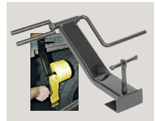
ANCRAX PORTABLE STRAP WINDER HOOKS ONTO TRAILER RAIL WORKS ON 2", 3" & 4" STRAPS HWG100800 $14.50