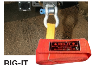
RIG-IT RECOVERY SYSTEM FITS ANY 2" RECEIVER 19,000LBS. LOAD STRENGTH 20" STRAP HWF230325 Regular Price $133 SALE $118.95