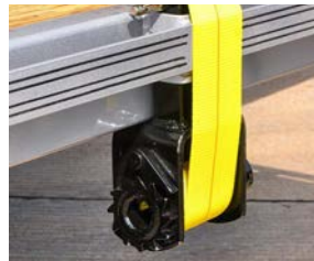
DIAMOND C STAKE POCKET 4" RATCHET EASY TO REMOVE & INSTALL PTM401017 $60.54