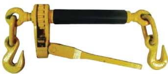
HD RATCHET LOAD BINDER 3/8" HWF220034 $89.95