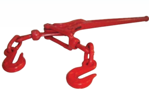
3/8" LOAD BINDER HWF220035 $25.99