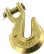
GRAB HOOKS FROM 5/16" COUPLING & NON-COUPLING