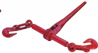
RATCHET LOAD BINDER 5/16" - 3/8" HWF220037 $49.95