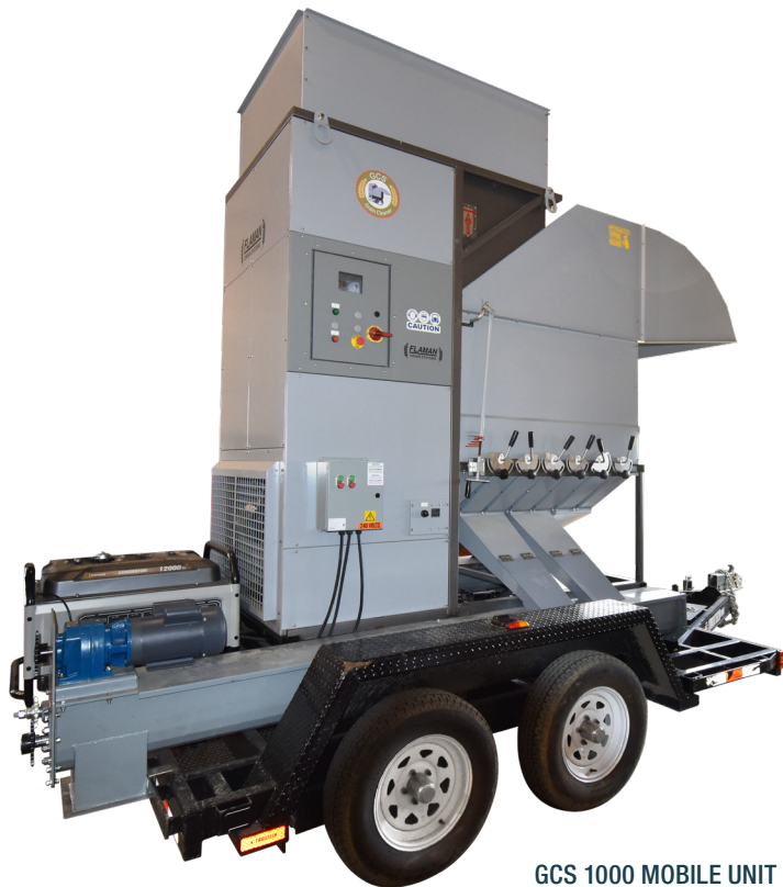
GCS 1000 MOBILE UNIT