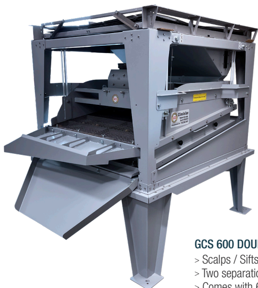
GCS 600 DOUBLE SHOE