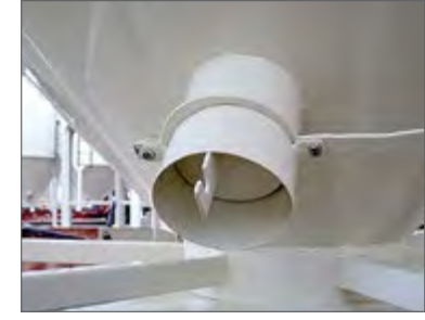
Pale Spout For spot feeding or sampling.