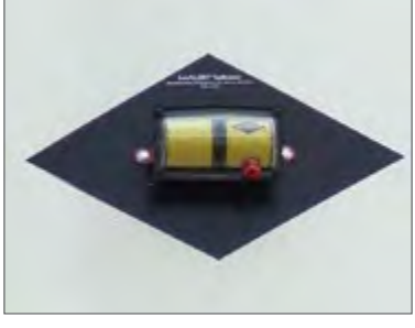
LevAlert Level indicator on sidewall.