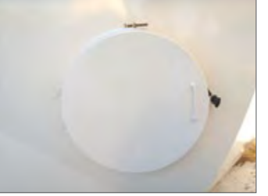
Roof Manhole Access hole in top cone.

Bean Ladder Helps maintain seed quality with bean-onbean flow.