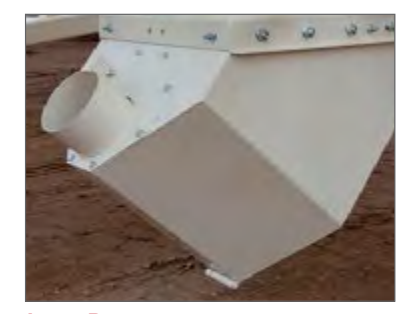
Auger Boot Fastens under slide gate. Available in Flanged, Non-Flanged and Flex Boot. (Non-Flanged shown).