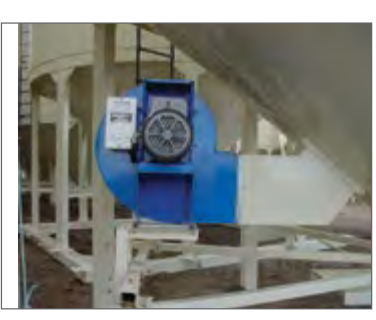
Fan Mounting Bracket Support bracket mounted under fan.