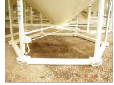
Skid Foundation Skid foundations are available for most bins.