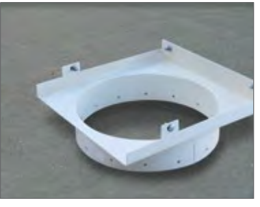
Slide Gate to Chore Time Adaptor Easy transition to Chore Time boot.