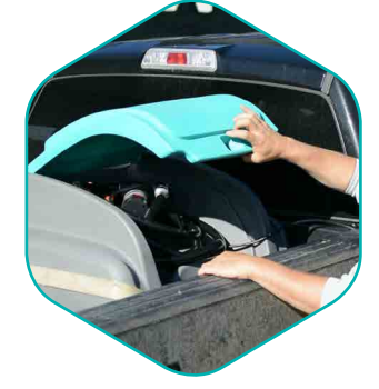
Protect your pump and components

Each Diesel Fuel Boss™ comes complete with a pump, hose and gun.