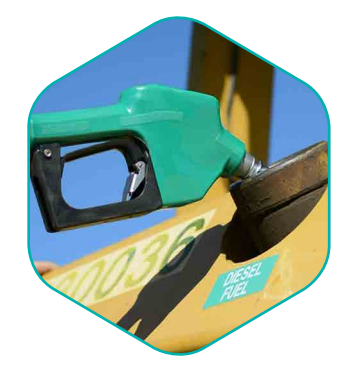
Minimize downtime on site

Keep your expensive pump protected with the built-in pump cover.