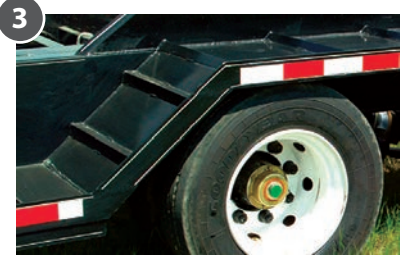
Drive Over Fenders

Beds are removable, allowing this trailer to be used as an equipment hauler when not being used as a sprayer trailer. Proper axle track width is maintained with this system.