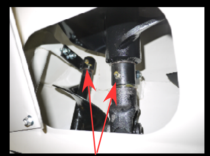
Easier access grease fittings