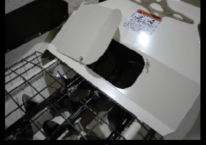
Easy Clean, removable mesh.

NEW, reverse screw with larger sprockets and jackscrew type tighteners !