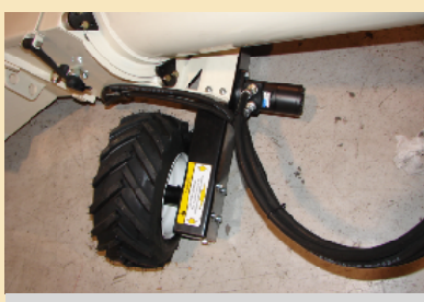
Super Lug 16" Traction Tires